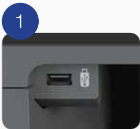
USB direct print*