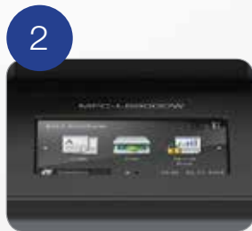
9.4cm TFT Colour LCD*