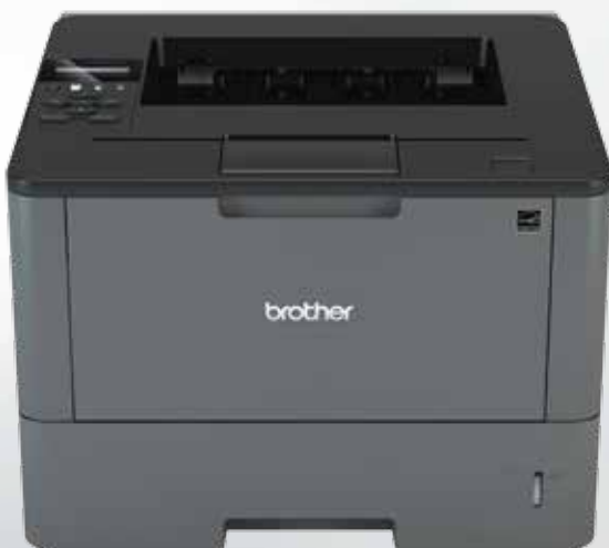
HL - L5200DW

Every business needs a reliable business partner. The new L5000 mono laser series helps you maximise print efficiency and minimise costs so you can make the most of your investment.