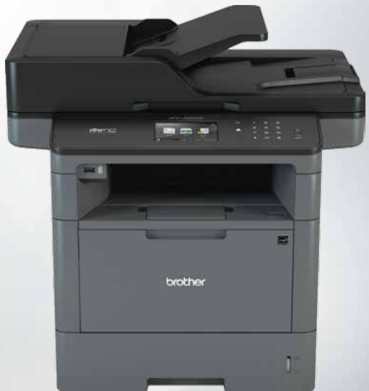
MFC - L5900DW